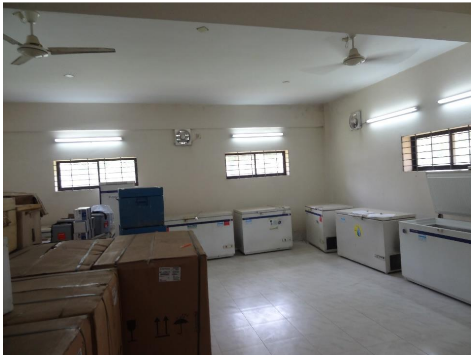
Figure 6.10: Existing Condition of Freezer Room at Ground floor