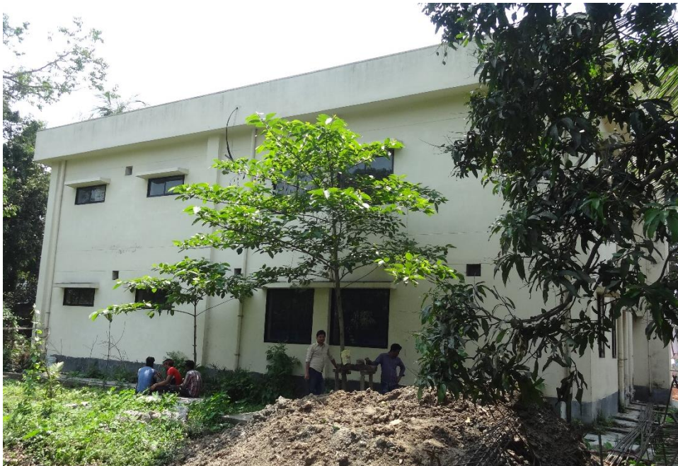
Figure 6.16: Backside Building Condition