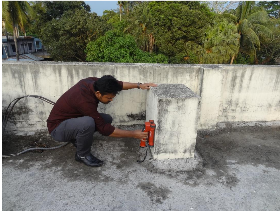
Figure 6.3: Checking Column Reinforcement and Spacing