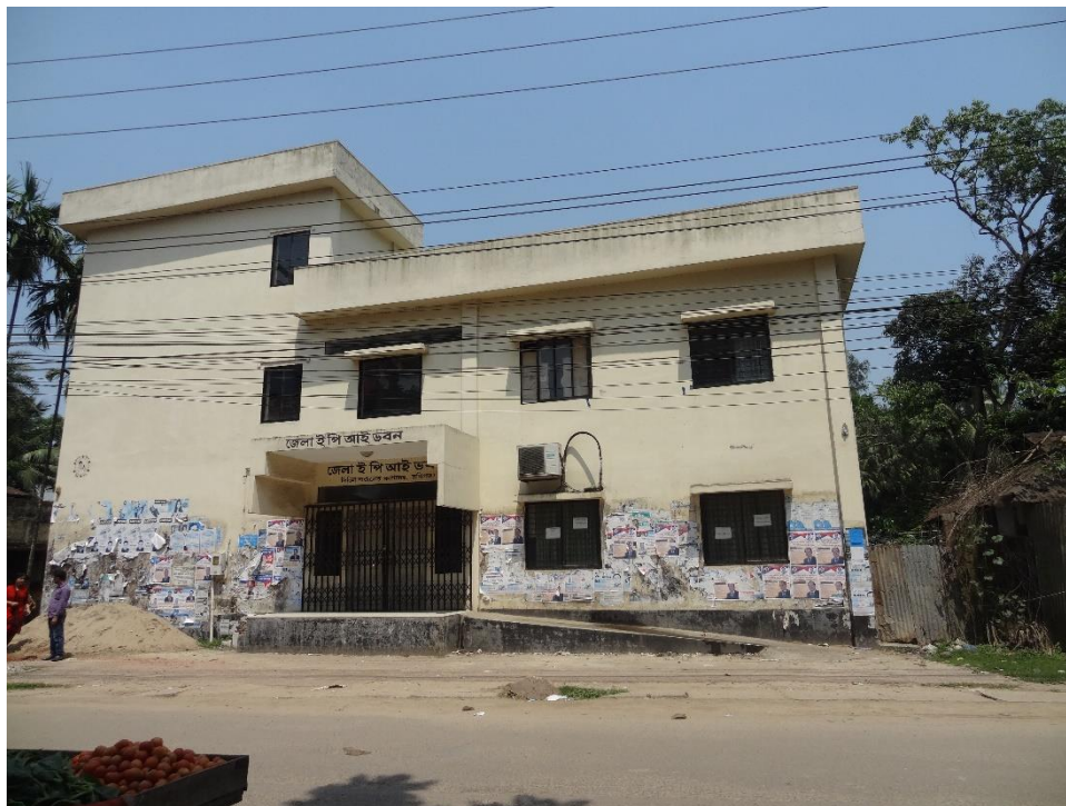
Figure 6.14: Front side Building Condition