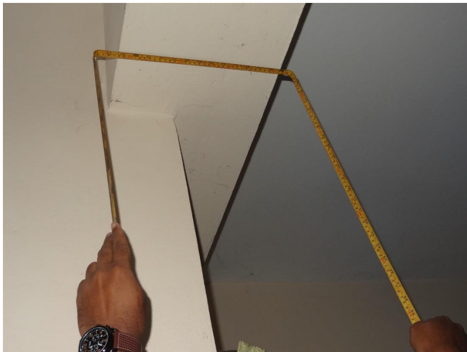
Figure 6.12: Measuring Beam Width