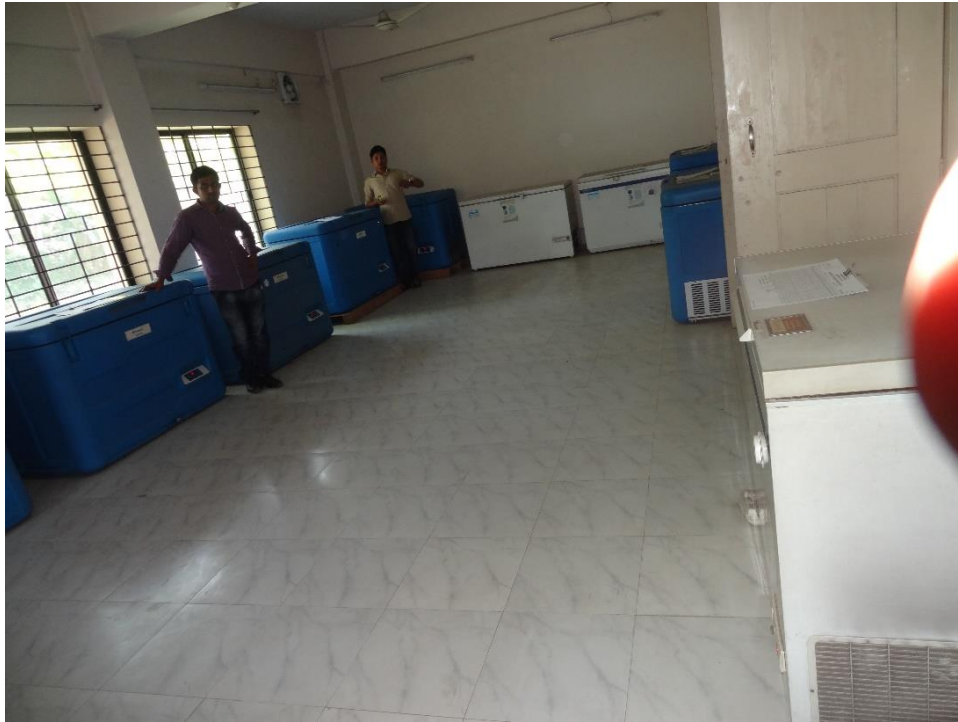
Figure 6.9: Existing Condition of Cold Room at Ground floor