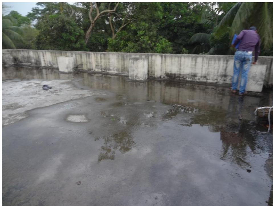
Figure 6.2: Existing Condition of Roof Slab