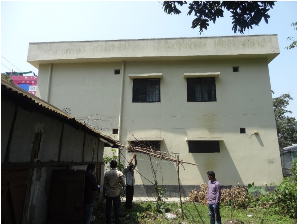
Figure 6.15: Building South Side View