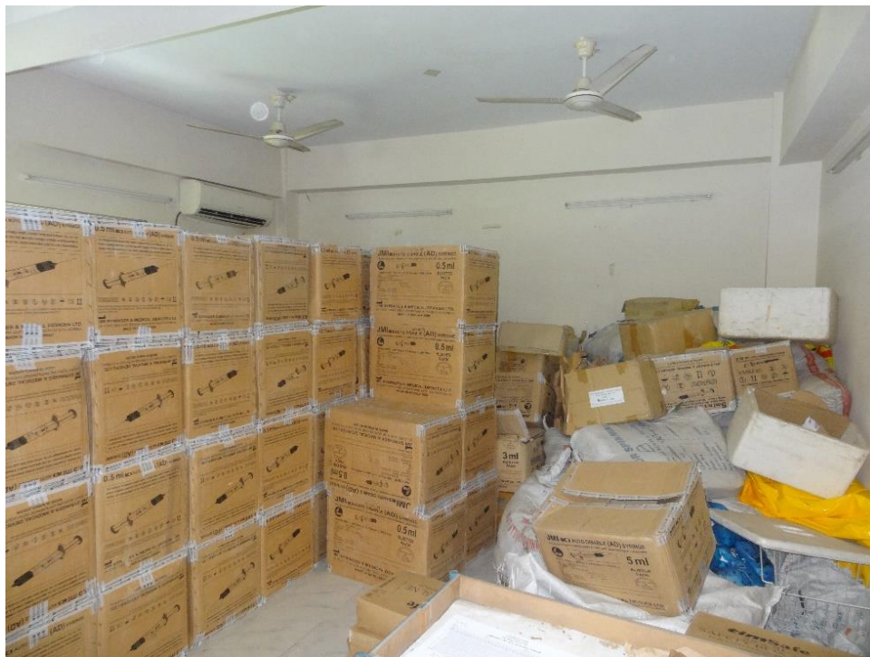
Figure 6.8: Existing Condition of Logistic Room at 1st floor