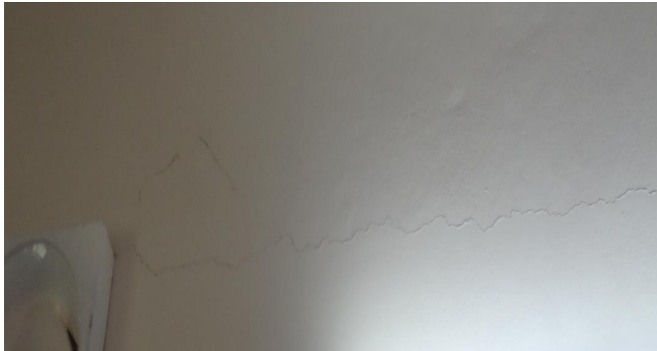
Figure 6.1: Partition wall plaster cracked

Major observations are highlighted in the following figures: