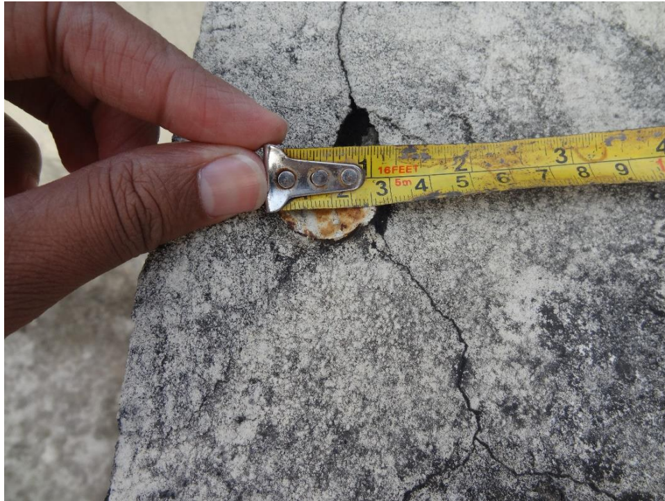
Figure 6.5: Exposed Rebar of roof false Column