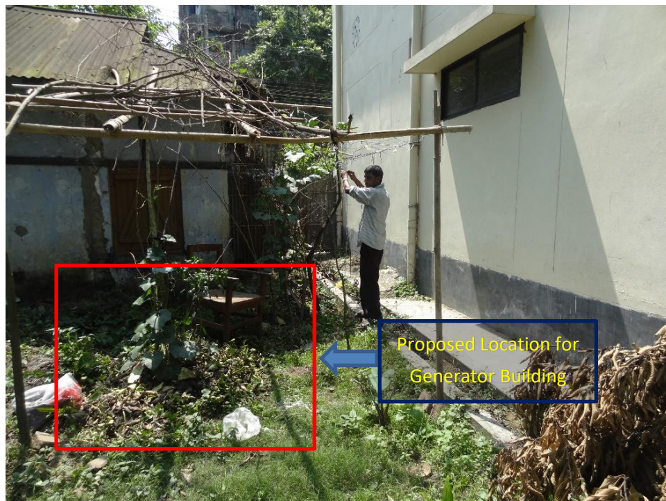
Figure 8.1: Proposed land for the construction of new generator building (in South side)