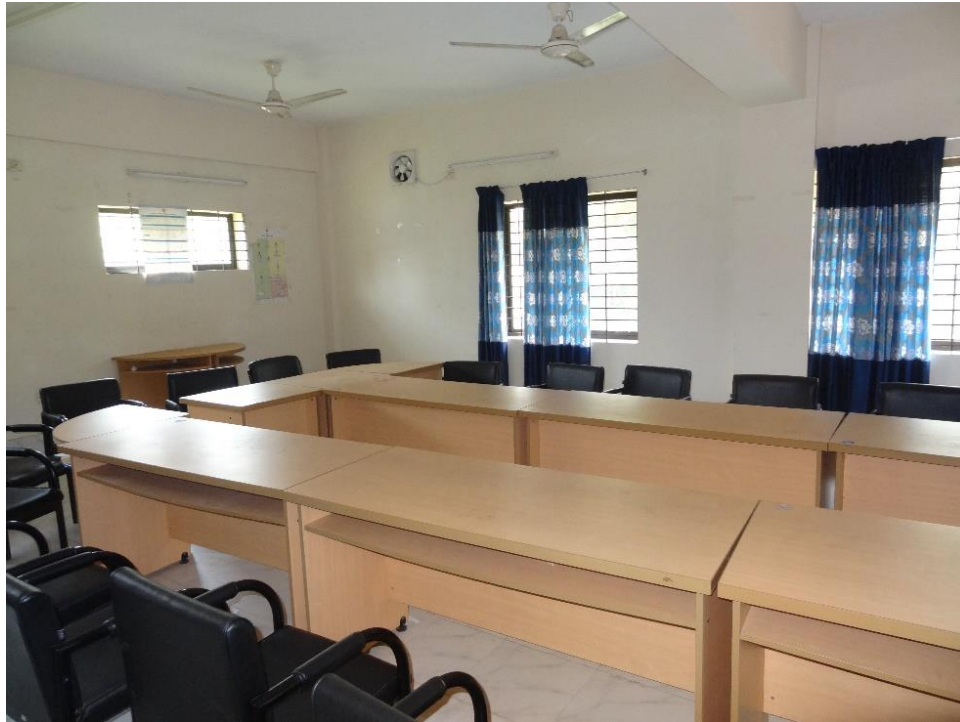
Figure 6.7: Existing Conference Room at 1 st Floor