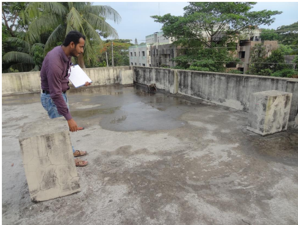
Figure 6.6: Checking of column to column spacing