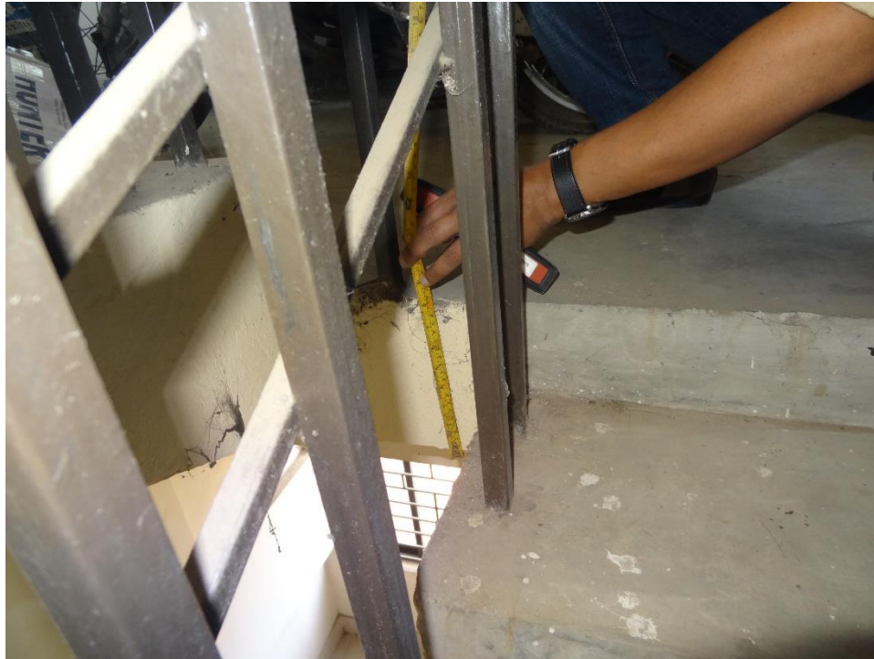
Figure 6.13: Measuring waist slab thickness