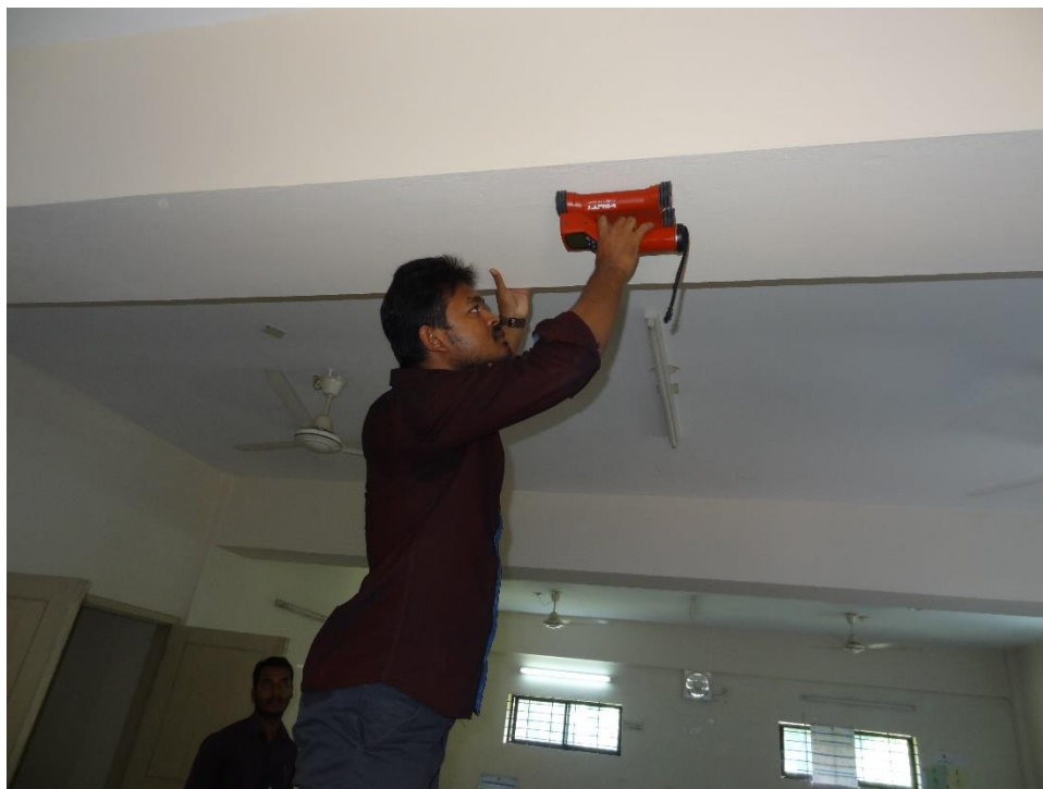
Figure 6.4: Checking Beam Reinforcement and Spacing